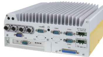
*R.O.C Patent No. M456527/ I598820