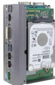
▲ POC-300 with MeziO™ - R11 and 2.5" HDD