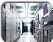
Data Center Management